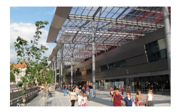
expertise in providing systems for sports facilities, SAUTER successfully secured the contract for planning and implementing the building automation in this challenging environment.

The stadium has an impressive appearance and employs state-ofthe-art technology to allow the building to be used efficiently for a variety of purposes – all under one roof. With its attractive tender and