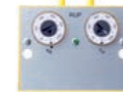
Differential pressure controller/transducer RUP 105