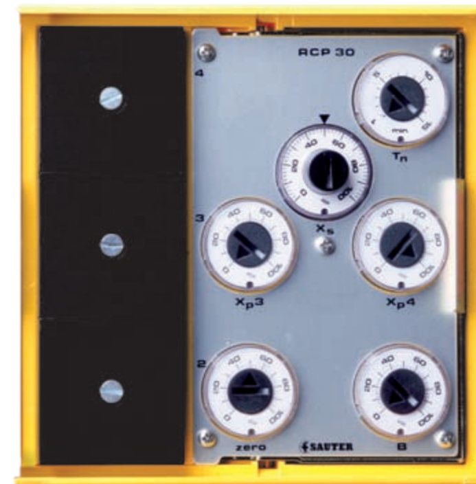
Cascade controller RCP 30