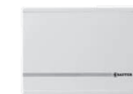
Room-temperature transducer TSUP 224