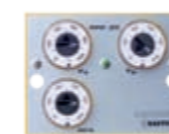
P-controller RPP 20

The measuring element generates a force that changes in proportion to the measured value. A highly sensitive bleed-off force-balance system converts this force into a linear standard pressure signal which is forwarded to the controller.