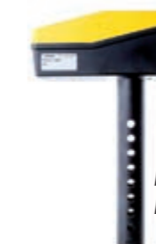
Humidity transducer HTP 151