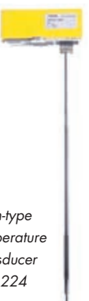
Stem-type temperature transducer TUP 224